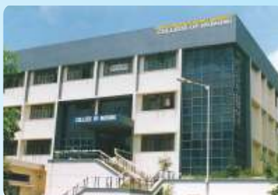
College of Nursing, Pune