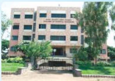
College of Physical Education, Pune