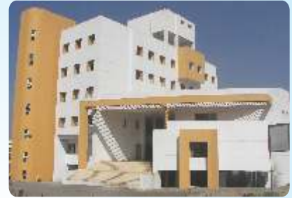
Rajiv Gandhi Institute of Information Technology and Biotechnology, Pune