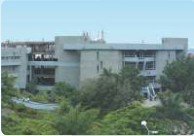
College of Engineering, Pune