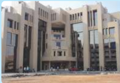
Dental College & Hospital, Navi Mumbai