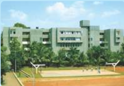
Institute of Management and Entrepreneurship Development, Pune