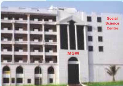
Social Science Centre (M.S.W.), Pune