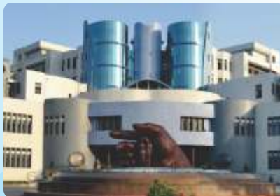
Medical College & Hospital, Sangli