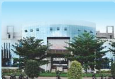
Dental College & Hospital, Sangli