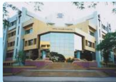
Dental College & Hospital, Pune