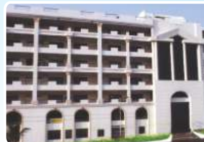
Yashwantrao Chavan Institute of Social Science Studies & Research, Pune