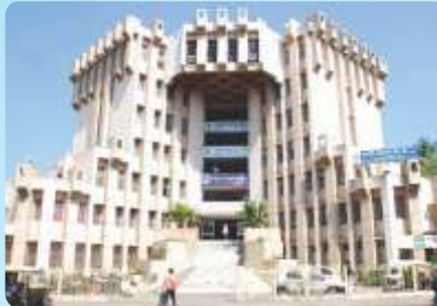
Institute of Management and Rural Development Admin., Sangli