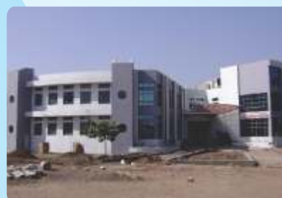
College of Nursing, Sangli