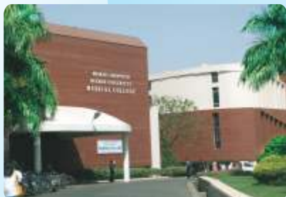
Medical College, Pune