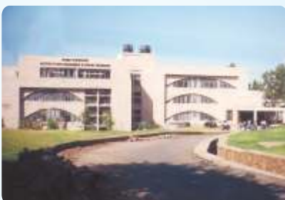
Institute of Hotel Management and Catering Technology, Pune