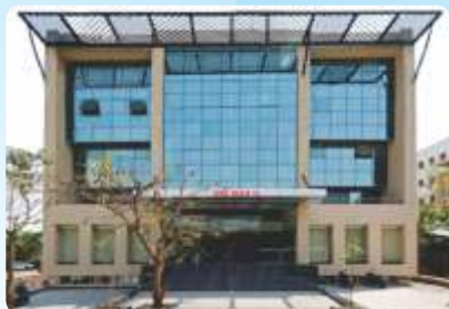
Interactive Research School for Health Affairs (IRSHA), Pune