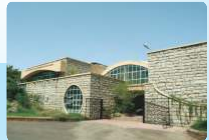
Institute of Environment Education and Research, Pune