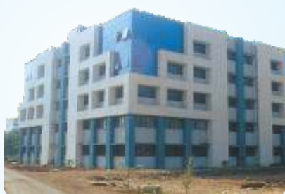
College of Nursing, Navi Mumbai