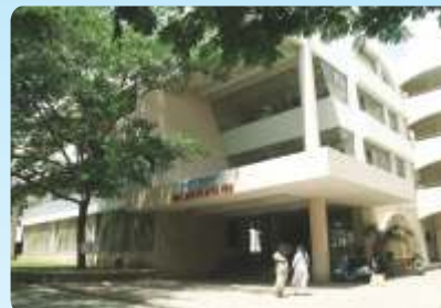
College of Ayurved, Pune