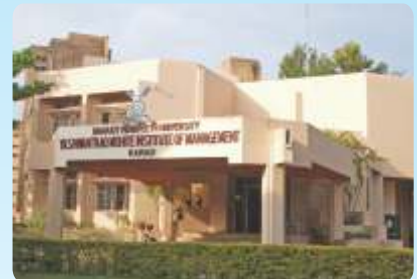
Yashwantrao Mohite Institute of Management, Karad