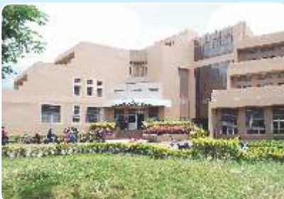
Institute of Management, Kolhapur