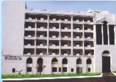
New Law College, Pune