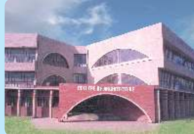
College of Architecture, Pune