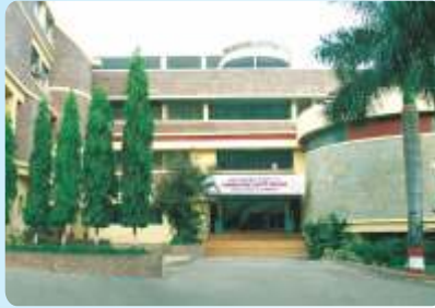
Y.M. College of Arts, Science and Commerce, Pune