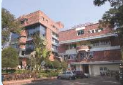
Poona College of Pharmacy, Pune