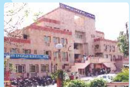
Institute of Management and Research, New Delhi