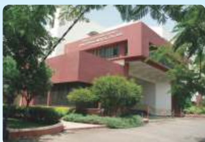
Homoeopathic Medical College, Pune