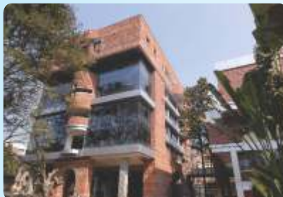
Centre for Research & Development in Pharmaceutical Sciences & Applied Chemistry, Pune